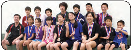
MDTTC Junior Olympics Winners

Additional MDTTC Thursday & Saturday classes are offered through Maryland's Montgomery County Recreation Department. Please visit mdttc.com for more details.